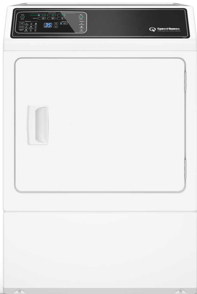
ADEE8B ELEC & ADGE8B GAS ADEE8BGS435AW01 & ADGE8BGS305AW01