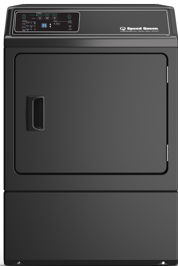
ADEE8B MB ADEE8BGS435AB99